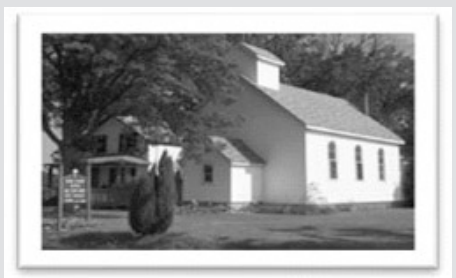
Star of the Sea

St. Vincent de Paul Harrow (Voice mail) 519-971-2095 Kingsville 226-340-6673